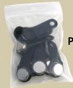
Pack of 10 iButtons