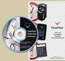
Software CD and Instruction Manual